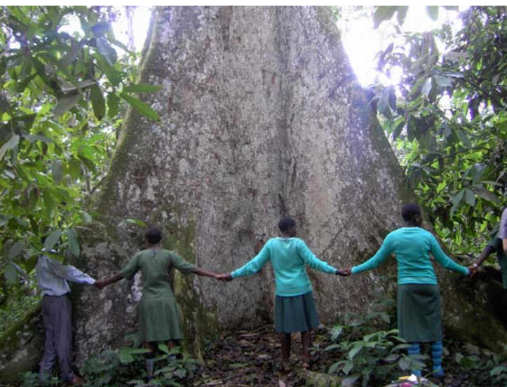
At Mefou National park (left) they saw rainforest trees, and animals.