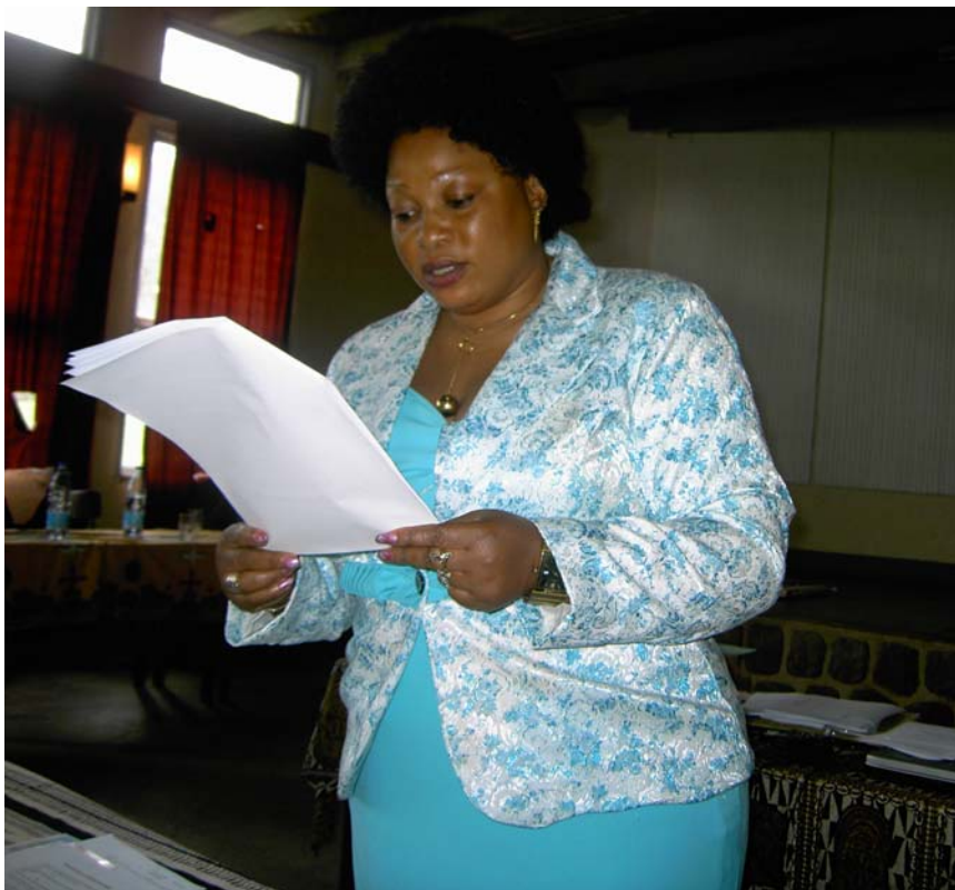
LEFT - A participant responds to 'task one.'